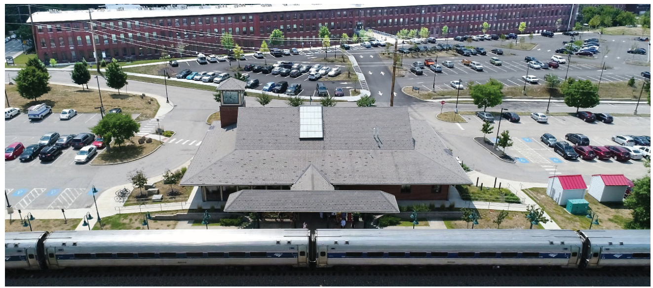
In Saco, this is one of many Chinburg projects that are also located at Downeaster stops in Exeter, Durham, Dover, and Haverhill.

Chinburg Properties was founded in 1987, originally as a builder and developer of quality single family homes. In 1996 the company acquired its first former mill building, in Portsmouth, NH, and completed a historic renovation to transform this abandoned Downeaster property into 65 modern live and work spaces. The team fell in love with the challenge and the satisfaction of taking decrepit and crumbling structures and transforming the landscape for the better. They haven't looked back. In the past 20 years the company has