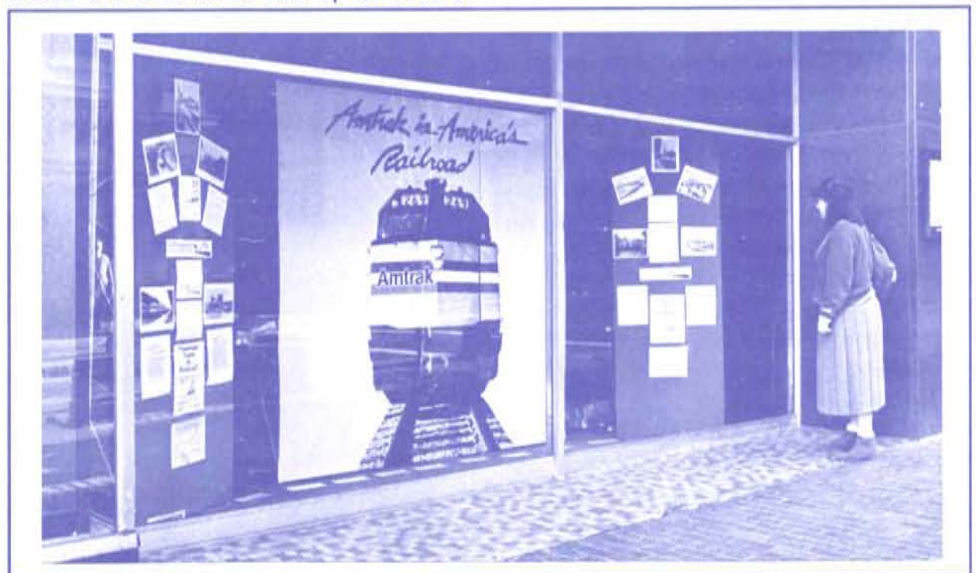
This is the TrainRiders/Northeast window in the Porteous building on Congress St., Portland, showing the display which is on loan from AMTRAK. The window has been responsible for many new members and has raised local awareness of our cause.

The House should be urged to pass a similar bill incorporating flexibility of States and their metropolitan planning organizations to use Federal transportation funding in the manner most effective in their areas. NARP News , June 1991